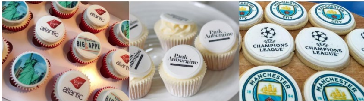
Sector: Food and Drink