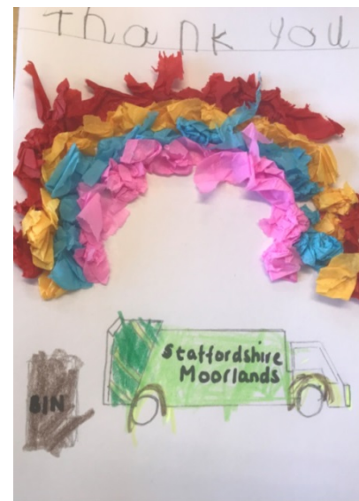
Public thanks for waste collections during pandemic lockdown