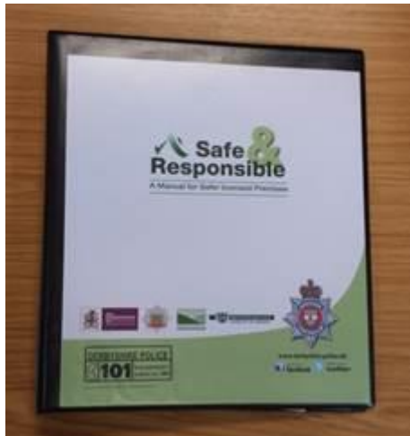
Safe and Responsible Folder